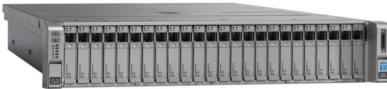
Figure 1. Cisco UCS C240 M4 Rack Server

The Cisco UCS ® C240 M4 Rack Server is our newest 2-socket, 2-rack-unit (2RU) rack server (Figure 1.) It offers outstanding performance and expandability for a wide range of storage and I/O-intensive infrastructure workloads, from big data to collaboration. The enterprise-class Cisco UCS C240 M4 server extends the capabilities of the Cisco Unified Computing System ™ (Cisco UCS) portfolio in a 2RU form factor with the addition of the Intel ® Xeon ® processor E5-2600 v3 product family, which delivers a superb combination of performance, flexibility, and efficiency.