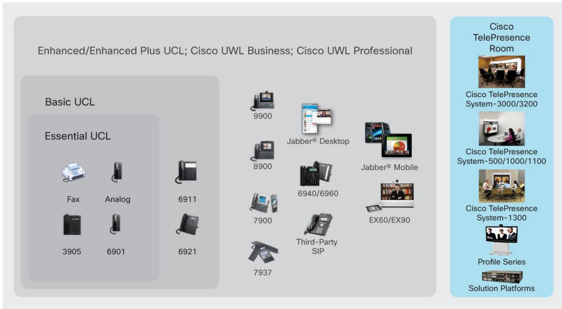
Figure 2. Device Support

Figure 2 lists the device types supported with each license type.