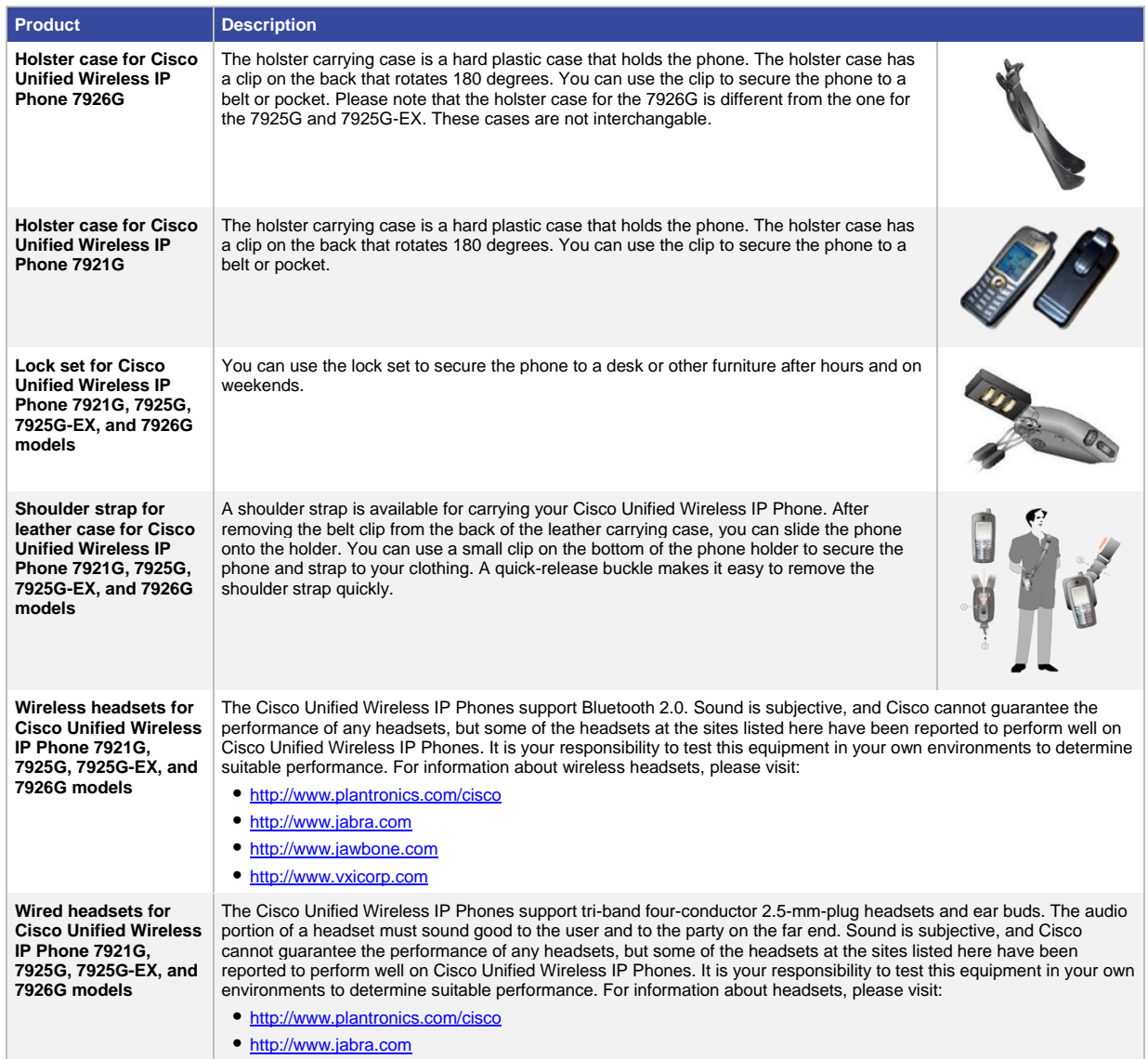
Table 2 provides ordering information for the accessories.