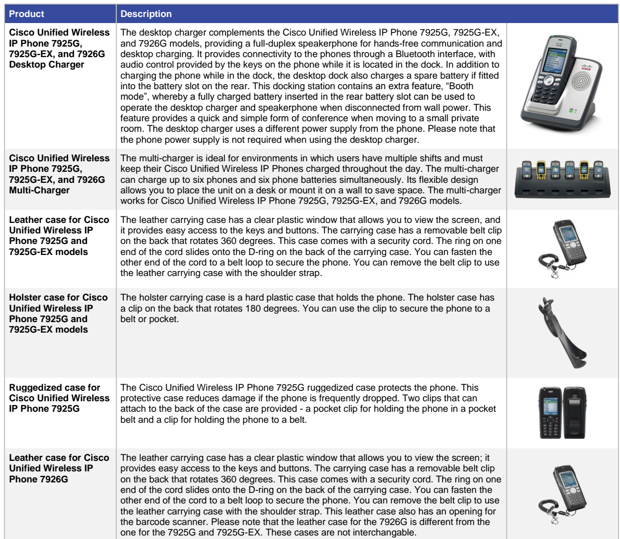
Table 1. Accessories for the Cisco Unified Wireless IP Phone 7921G, 7925G, 7925G-EX, and 7926G Models

To enhance the user experience, Cisco and our third-party partners offer many accessories for the Cisco® Unified Wireless IP Phone 7921G, 7925G, 7925G-EX, and 7926G models. Table 1 lists these accessories with descriptions.