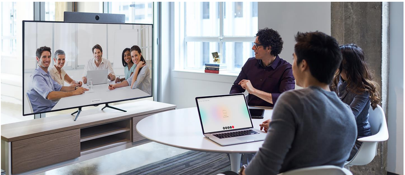
Figure 1. Cisco Spark Room Kit in small room scenario

The Room Kit – which includes camera, codec, speakers, and microphones integrated in a single device – is ideal for rooms that seat up to seven people. It offers sophisticated camera technologies that bring speaker-tracking capabilities to smaller rooms. The product is rich in functionality and experience but is priced and designed to be easily scalable to all of your small conference rooms and spaces – whether registered on the premises or to Cisco Spark through the Cisco® Collaboration Cloud.