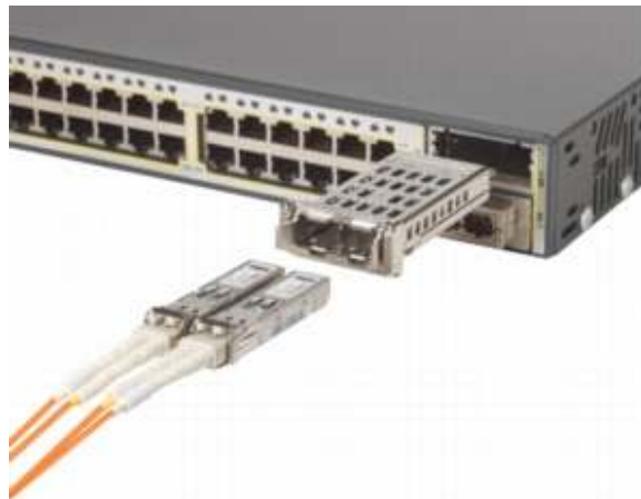
Figure 2. Cisco TwinGig Converter Module Converts a 10 Gigabit Ethernet X2 Interface into Two Gigabit Ethernet SFP Ports in the Catalyst 3750-E and Catalyst 3560-E Series Switches.

The TwinGig SFP Converter Module can also be used with the Cisco Catalyst 4500 E-Series Supervisor 6-E (Figure 4) and the Cisco Catalyst 4500 E-Series 6-Port 10 Gigabit Ethernet Line Card (Figure 5).