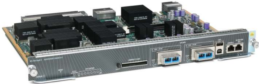
Figure 5. Cisco TwinGig Converter Module converts each 10 Gigabit Ethernet X2 Interface into Two Gigabit Ethernet SFP Ports with Catalyst 4500 E-Series 6-port 10 Gigabit Ethernet Linecard