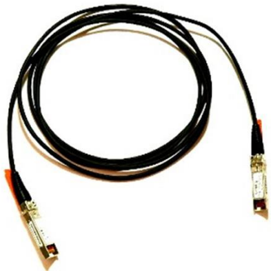
Figure 2. Cisco Direct-Attach Twinax Copper Cable Assembly with SFP+ Connectors