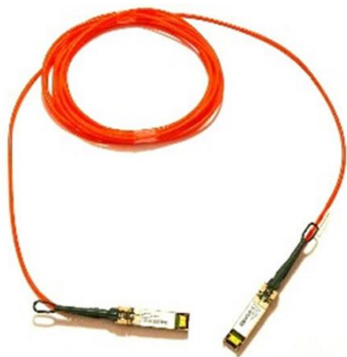
Figure 3. Cisco Direct-Attach Active Optical Cables with SFP+ Connectors

Cisco SFP+ Active Optical Cables (Figure 3) are direct-attach fiber assemblies with SFP+ connectors. They are suitable for very short distances and offer a cost-effective way to connect within racks and across adjacent racks. Cisco offers Active Optical Cables in lengths of 1, 2, 3, 5, 7, and 10 meters.