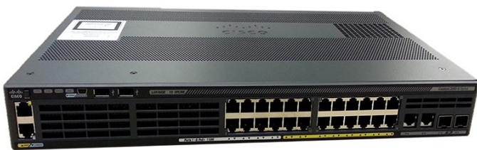
Figure 4. Fanless Quiet Cool 24-Port PoE Switch

The Cisco Catalyst 2960-X Series adds a new member to its 2960-X family, the WS-C2960X-24PSQ-L (Cool). This is a 24-port 10M/100M/1000M switch that can power up to 8 ports of PoE (first eight ports only) with ability to deliver a sum total of 110W of PoE power. This switch has four Gigabit Ethernet uplinks: two of them SFP and the other two 10M/100M/1000M copper interfaces enabling choice of fiber or copper connectivity to the aggregation point. This switch ships with the Cisco IOS LAN Base image.