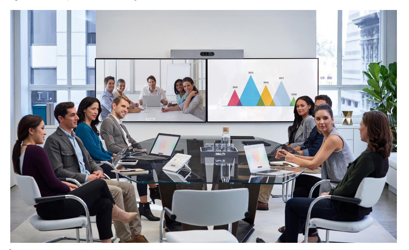
Figure 1. Cisco Spark Room Kit Plus in large conference room

The Room Kit Plus – comprising a powerful codec and a quad-camera bar with integrated speakers and microphones* – is ideal for rooms that seat up to 14 people. It offers sophisticated camera technologies that bring speaker-tracking and auto-framing capabilities to medium to large-sized rooms. The product is rich in functionality and experience but is priced and designed to be easily scalable to all of your conference rooms and spaces – whether registered on the premises or to Cisco Spark through the Cisco® Collaboration Cloud.