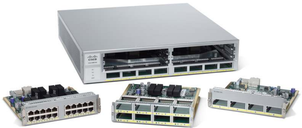
Figure 1. Cisco Catalyst 4900M

The Cisco Catalyst 4900M half cards provide a wide variety of combinations of Gigabit Ethernet and 10 Gigabit Ethernet media types. The base unit can accommodate up to two of following half cards in any combination: