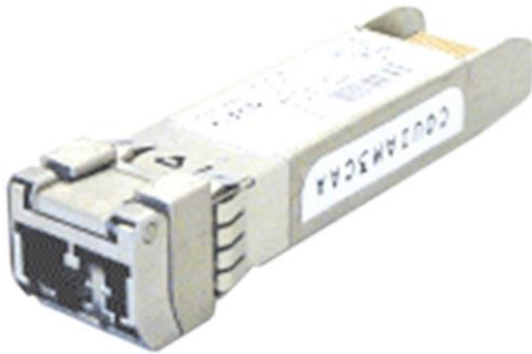
Figure 1. Cisco 10GBASE SFP+ Modules

The Cisco® 10GBASE SFP+ modules (Figure 1) give you a wide variety of 10 Gigabit Ethernet connectivity options for data center, enterprise wiring closet, and service provider transport applications.