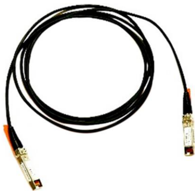
Figure 3. Cisco Direct-Attach Twinax Copper Cable Assembly with SFP+ Connectors

Cisco SFP+ Copper Twinax (Figure 3) direct-attach cables are suitable for very short distances and offer a cost-effective way to connect within racks and across adjacent racks. Cisco offers passive Twinax cables in lengths of 1, 1.5, 2, 2.5, 3 and 5 meters, and active Twinax cables in lengths of 7 and 10 meters.