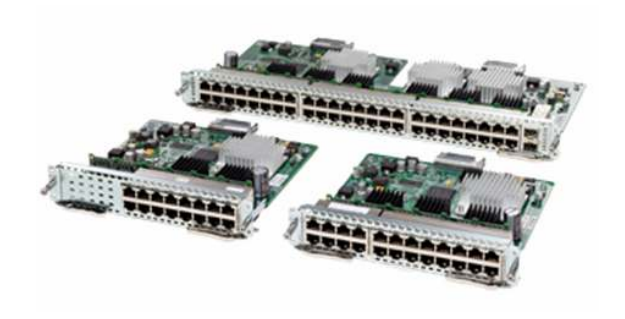
Figure 1. Cisco Enhanced EtherSwitch Service Modules

The Cisco Enhanced EtherSwitch Service Modules (Figure 1) greatly expands the router's capabilities by integrating industry-leading Layer 2 and Layer 3 switching with feature sets identical to those found in the Cisco Catalyst® 3560-E and Catalyst 2960 Series Switches. The new Cisco Enhanced EtherSwitch Service Modules are the first modules to take advantage of the increased capabilities on the Cisco 3900 and 2900 Series Integrated Services Routers. Additionally, these service modules enable Cisco's industry-leading power initiatives, Cisco EnergyWise®, Cisco Enhanced Power over Ethernet (ePoE), and per-port PoE power monitoring—all of which enhance the ability of the branch office to scale to next-generation requirements and still meet important initiatives for IT teams to operate a power efficient network. Furthermore, the Cisco Enhanced EtherSwitch Service Modules not only perform local line-rate switching and routing but also support direct service module-to-service module communication through the Integrated Services Router Generation 2 multigigabit fabric (MGF) which separates LAN traffic from WAN resources.