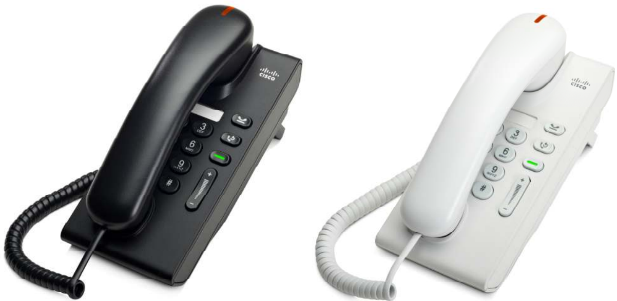
Figure 1. Cisco Unified IP Phone 6901

Cisco® Unified Communications Solutions enable collaboration so that organizations can quickly adapt to market changes while increasing productivity; improving competitive advantage through speed and innovation; and delivering a rich-media experience across any workspace, securely and with optimal quality.