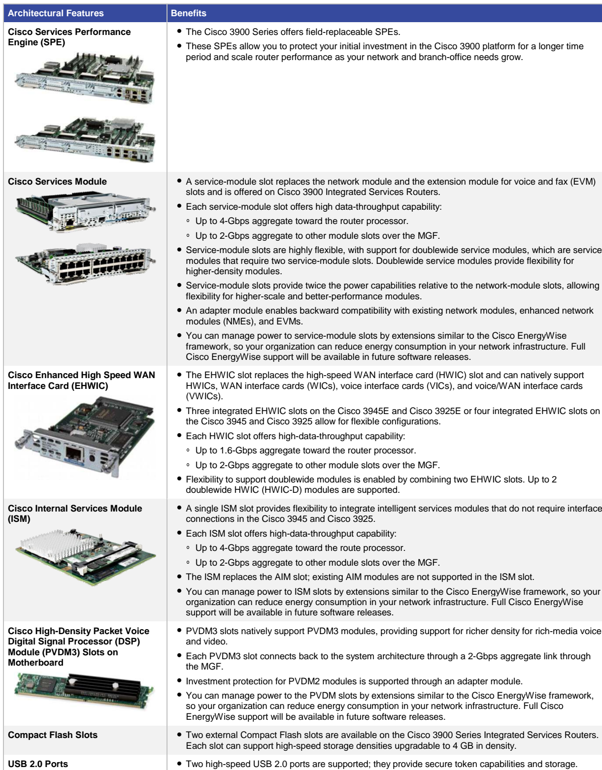
Table 3. Modularity Features and Benefits