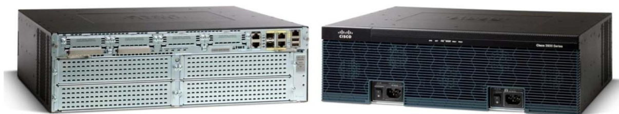
Figure 1. Cisco 3900 Series Integrated Services Routers

Cisco® 3900 Series Integrated Services Routers build on 25 years of Cisco innovation and product leadership. The new Cisco Integrated Services Routers Generation 2 (ISR G2) platforms are architected to enable the next phase of branch-office evolution, providing rich-media collaboration and virtualization to the branch office while maximizing operational cost savings. The new routers support new high-capacity digital signal processors (DSPs) for future enhanced video capabilities, high-powered service modules with improved availability, multicore CPUs, Gigabit Ethernet switching with Cisco Enhanced Power over Ethernet (ePoE), and new energy visibility and control capabilities while enhancing overall system performance. Additionally, a new Cisco IOS® Software Universal image and Cisco Services Ready Engine (SRE) module enable you to decouple the deployment of hardware and software, providing a flexible technology foundation that can quickly adapt to evolving network requirements. Overall, the Cisco 3900 Series offers exceptional total cost of ownership (TCO) savings and network agility through the intelligent integration of market-leading security, unified communications, wireless, and application services.