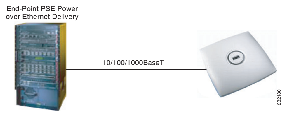
Figure 1 End-Point PSE PoE Delivery

Power delivery, supported within Cisco Catalyst Ethernet switches, relies on the data pairs (pins 1-2 and 3-6) to transmit power (sometimes referred to as "phantom" power). The second mechanism relies on the unused data pairs (pins 4-5 and 7-8) to deliver power that is supported within mid-span power delivery.