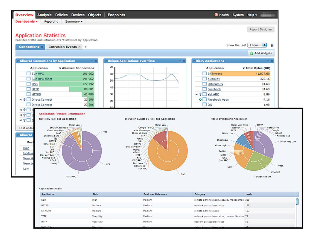
Figure 2. Cisco FireSIGHT Management Center: Intuitive High-Level and Detailed Drill-Down Dashboards