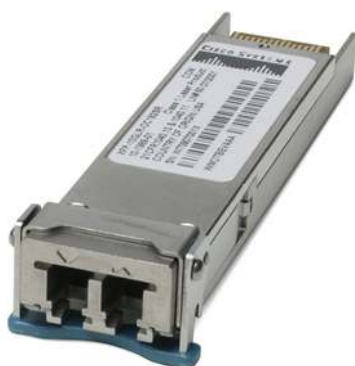
Figure 1. Cisco XFP Module

Main features of the Cisco XFP Module include: