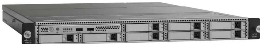
Figure 1. Cisco UCS C22 M3 Server

The Cisco UCS C22 M3 server interfaces with Cisco UCS using another unique Cisco® innovation: the Cisco UCS Virtual Interface Card 1225 (VIC 1225). The Cisco UCS VIC 1225 is a virtualization-optimized Fibre Channel over Ethernet (FCoE) PCIe 2.0 x8 10-Gbps adapter designed for use with Cisco UCS C-Series servers. The VIC is a dual-port 10 Gigabit Ethernet PCIe adapter that can support up to 256 PCIe standards-compliant virtual interfaces, which can be dynamically configured so that both their interface type (network interface card [NIC] or host bus adapter [HBA]) and identity (MAC address and worldwide name [WWN]) are established using just-in-time provisioning. In addition, the Cisco UCS VIC 1225 can support network interface virtualization and Cisco Data Center Virtual Machine Fabric Extender (VM-FEX) technology.