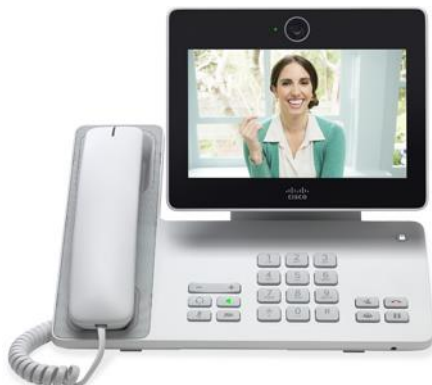
Figure 1. Cisco DX650