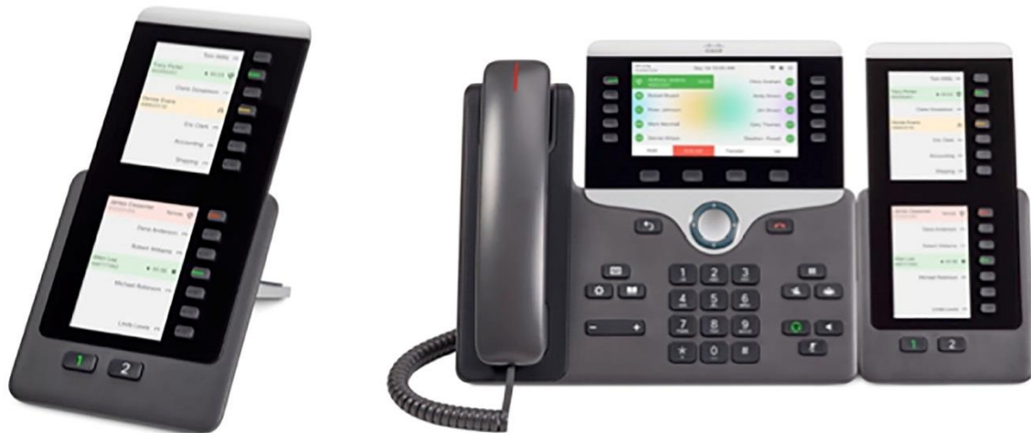
Figure 1. Cisco IP Phone 8851/61 Key Expansion Module

Quickly adapt to market changes. Increase productivity. Improve competitive advantage through speed and innovation. And deliver a rich-media experience across any workspace securely and with the best possible quality. Cisco® Unified Communications Solutions enable the collaboration that makes this possible (Figure 1).