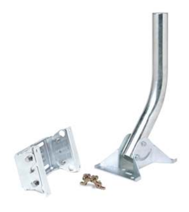
Figure 5. Cisco Aironet 1400 Series Bridge Accessories

To complete an installation, Cisco provides a variety of accessories that offer increased functionality, safety, and convenience (Figure 5; Table 11).