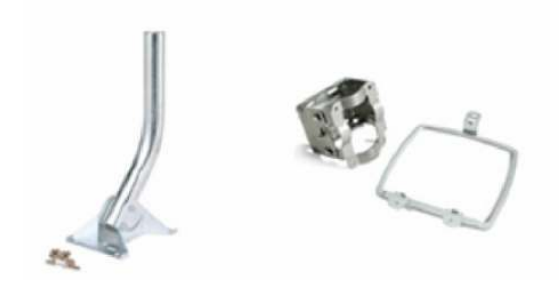
Figure 6. Cisco Aironet 1300 Series Mounting Hardware

In addition to the antennas available from Cisco, the Cisco 1300 Series has different mounting options (Figure 6). These optional mounting kits are available for mounting to a roof, wall, or pole. The quick-hang mounting bracket allows a simple one-person installation.